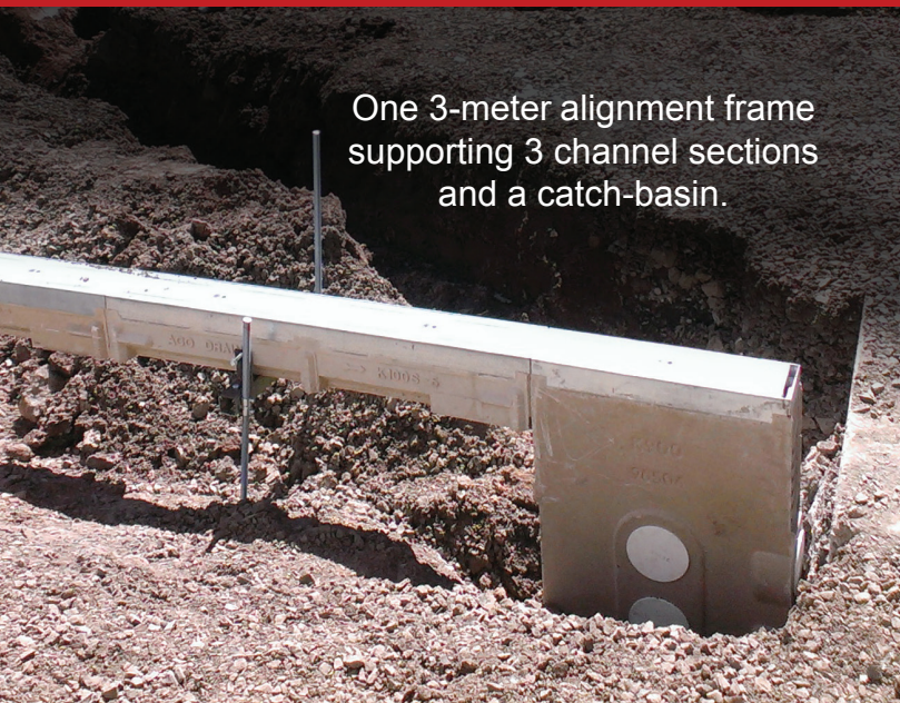
One 3-meter alignment frame supporting 3 channel sections and a catch-basin.